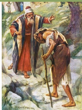
The Prodigal Son -- Harold Copping