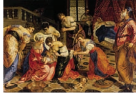
"The Birth of John the Baptist" - Jacopo Tintoretto (c. 1555)

Jesus called John the greatest of all those who had preceded him: "I tell you, among those born of women, no one is greater than John...."