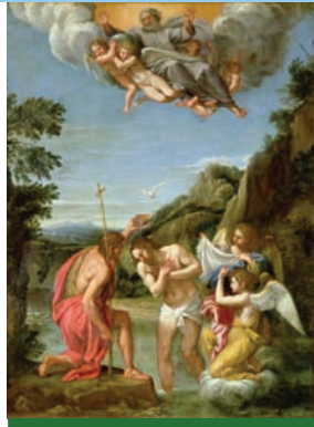
The Baptism of Christ - Francesco Albani