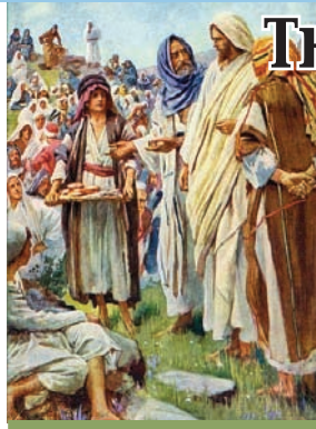
Feeding the 5000- Harold Copping