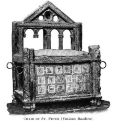
Chair of St. Peter (Vatican Basilica)

The feast of the Chair of Saint Peter at Antioch, commemorating his foundation of the See of Antioch, has also been long celebrated at Rome, in addition to a similar feast on 18 January, celebrating the first Mass over which Peter presided in Rome. At each place a chair (cathedra) is venerated which the Apostle had used while presiding at Mass. This feast is emblematic of the world unity of the Church.