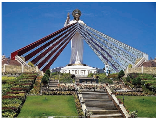
Cagayan de Oro, Mindanao (The Philippines)

Please pray for those in need of physical or spiritual healing