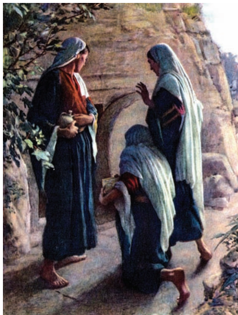
The Women at the Sepulchre -- Harold Copping (1927)