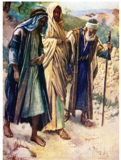
The Walk to Emmaus-- Harold Copping (1927)