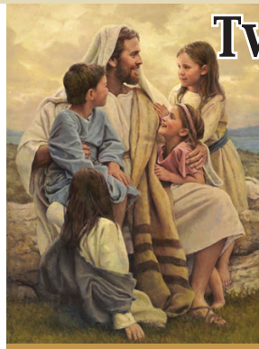
Perfect Love - Del Parson