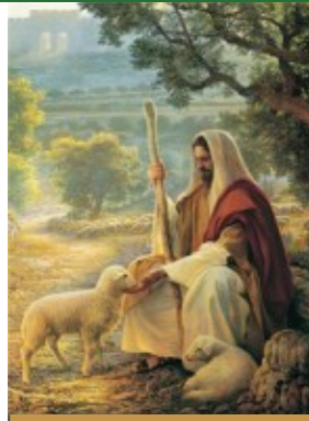
Lost No More - Greg Olsen