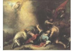
The Conversion of St. Paul, Bartolome Murillo