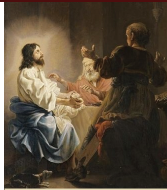
The Supper at Emmaus - Salomon de Bray (1650s)