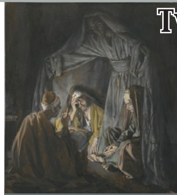
Two or Three Gathered in My Name -- James Tissot