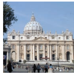
ST. PETER'S, ROME

DEDICATION OF THE BASILICAS OF SAINTS PETER AND PAUL