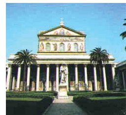
ST. PAUL'S, ROME