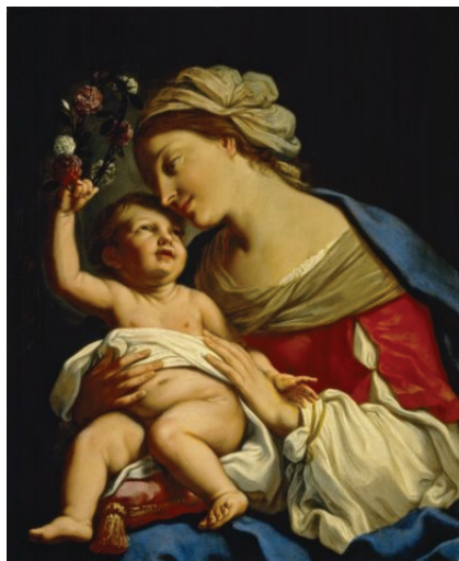
“Virgin and Child” -- Elisabetta Sirani (~1660)

Please pray for those in need of physical or spiritual healing