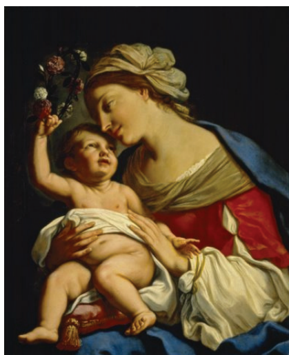
“Virgin and Child” -- Elisabetta Sirani (~1660)

Please pray for those in need of physical or spiritual healing