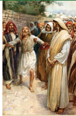
The Healing of Blind Bartimaeus - Harold Copping