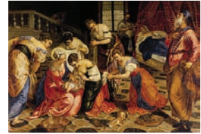
"The Birth of John the Baptist" - Jacopo Tintoretto (c. 1555)

Jesus called John the greatest of all those who had preceded Him: "I tell you, among those born of women, no one is greater than John...."