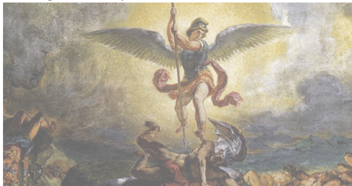
SAINT MICHAEL DEFEATS THE DEVIL - EUGENE DELACROIX