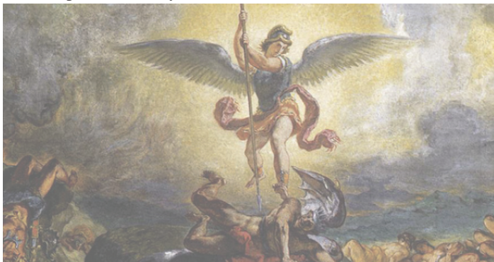
SAINT MICHAEL DEFEATS THE DEVIL - EUGENE DELACROIX