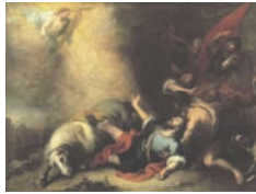
The Conversion of St. Paul. Bartolome Murillo

25 JAN (Wednesday): THE CONVERSION OF SAINT PAUL