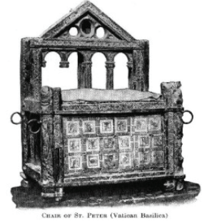
CHAIR OF ST. PETER (Vatican Basilica)

The feast of the Chair of Saint Peter at Antioch, commemorating his foundation of the See of Antioch, has also been long celebrated at Rome, in addition to a similar feast on 18 January, celebrating the first Mass over which Peter presided in Rome. At each place a chair (cathedra) is venerated which the Apostle had used while presiding at Mass. This feast is emblematic of the world unity of the Church.