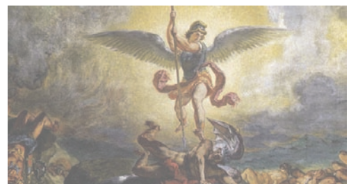
SAINT MICHAEL DEFEATS THE DEVIL - EUGENE DELACROIX