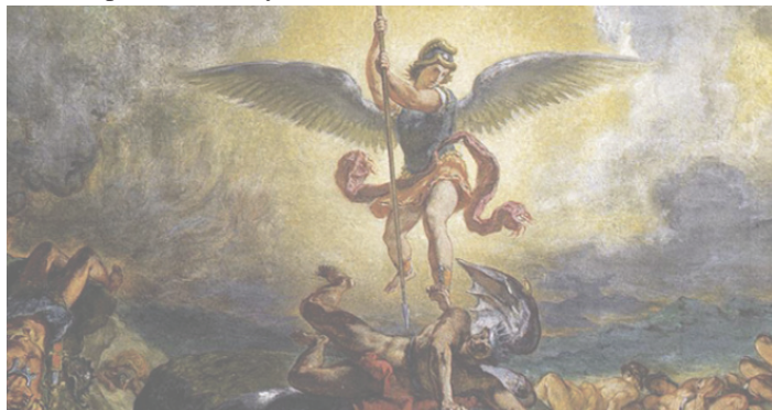
SAINT MICHAEL DEFEATS THE DEVIL - EUGENE DELACROIX