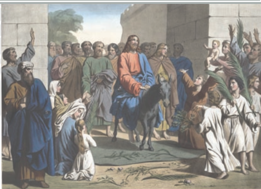
The Triumphal Entry of Christ into Jerusalem (detail) (19th century)