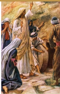
Lazarus, Come Forth! -- Harold Copping