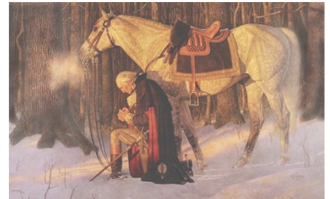
"The Prayer at Valley Forge" by Arnold Friberg