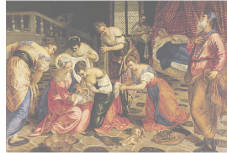
"The Birth of John the Baptist" - Jacopo Tintoretto (c. 1555)

Jesus called John the greatest of all those who had preceded him: "I tell you, among those born of women, no one is greater than John...."