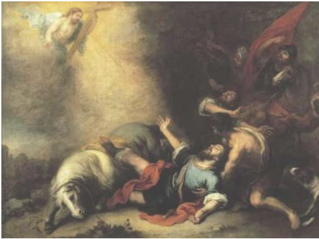
The Conversion of St. Paul, Bartolome Murillo