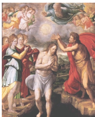
Baptism of Jesus, Juan Fernandez de Navarrete