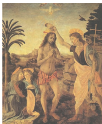
The Baptism of Christ, Verrocchio