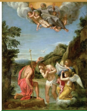
The Baptism of Christ, Francesco Albani

Heaven was opened and the Holy Spirit descended upon Him in the form of a dove. LUKE 3: 15-16, 21-22