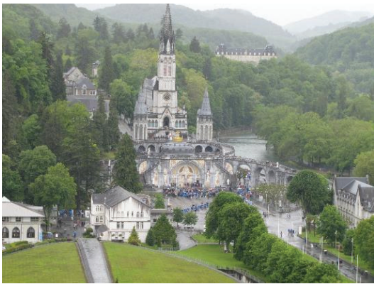
The Sanctuary of Our Lady of Lourdes