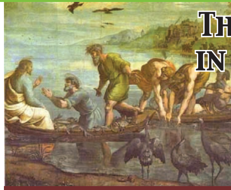
The Miraculous Draught of Fishes, Raphael