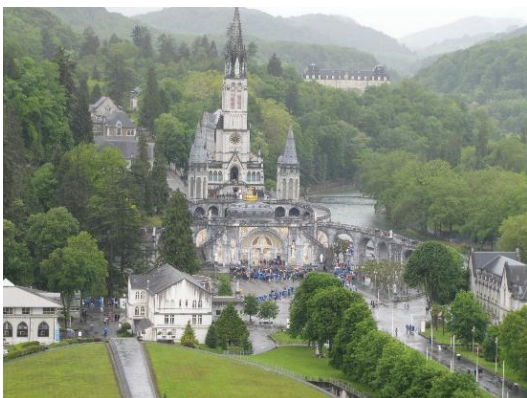
The Sanctuary of Our Lady of Lourdes