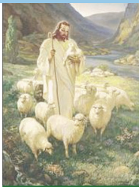
The Good Shepherd, Warner Sallman