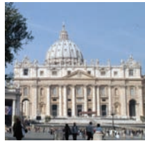
ST. PETER'S, ROME