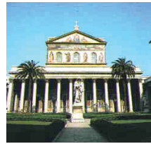
ST. PAUL'S, ROME