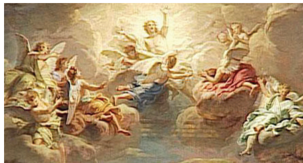
The Ascension of Christ (detail) - Jouvenet

www.ewtn.com/devotionals/heart/sh_novena.htm