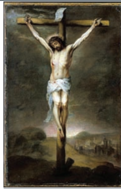
The Crucifixion - Bartolome Esteban Murillo