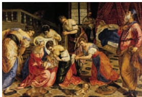
"The Birth of John the Baptist" - Jacopo Tintoretto (c. 1555)

Jesus called John the greatest of all those who had preceded him: "I tell you, among those born of women, no one is greater than John...."