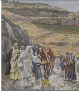
Jesus Discourses with His Disciples -- Tissot