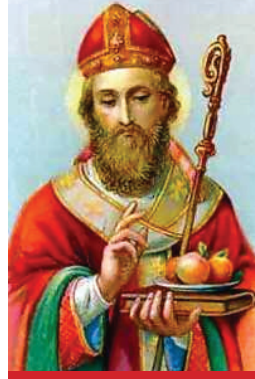
St. Nicholas of Myra